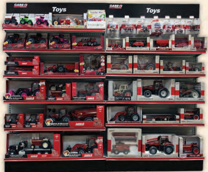
8 foot wall Toy and Replica