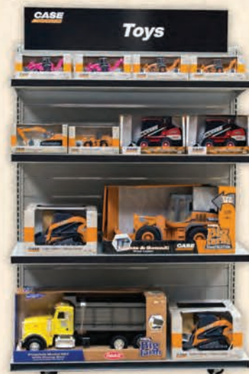
Case CE End Cap