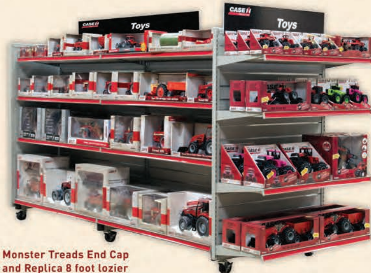
Monster Treads End Cap and Replica 8 foot lozier