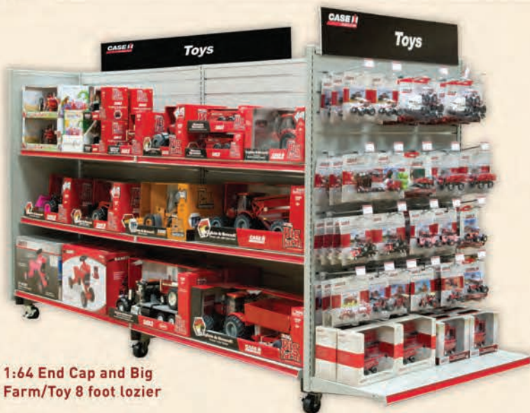
1:64 End Cap and Big Farm/Toy 8 foot lozier