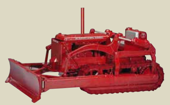
ZJD 1757 International TD-14 with Blade