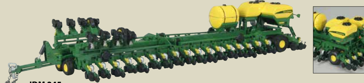
JDM 245 John Deere/Bauer Built 48-Row Planter with Fertilizer Tank