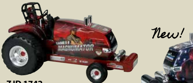
ZJD 1742 1:16 Case IH Magnumator 2 Puller