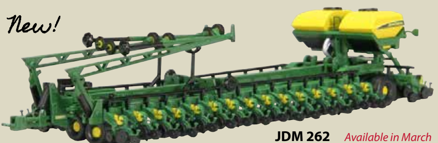
John Deere/Bauer Built 36-Row Planter