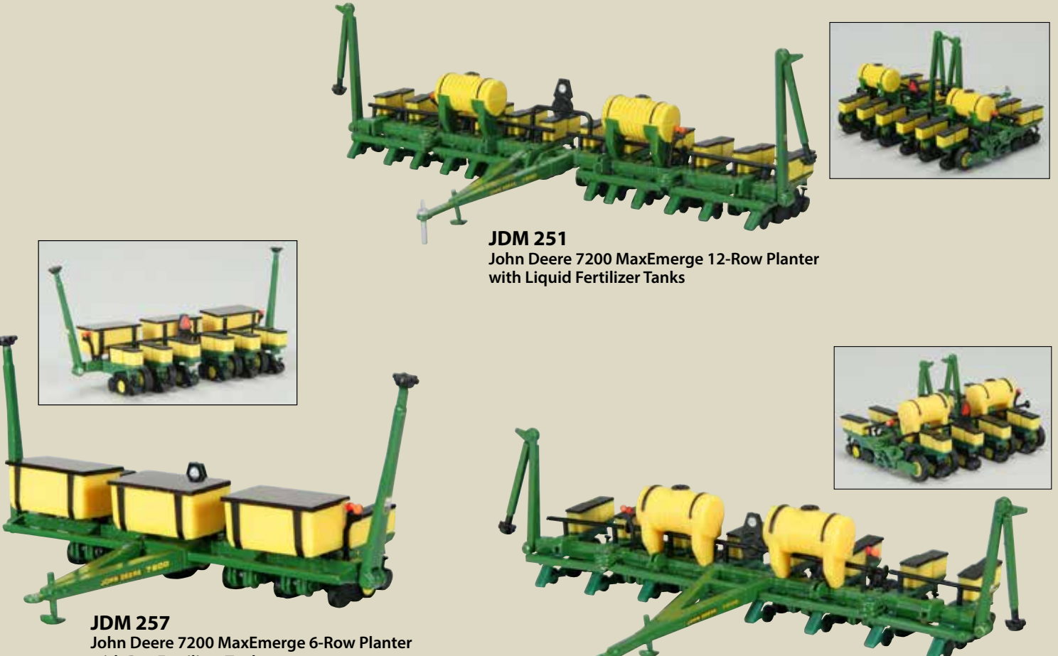
with Dry Fertilizer Tanks