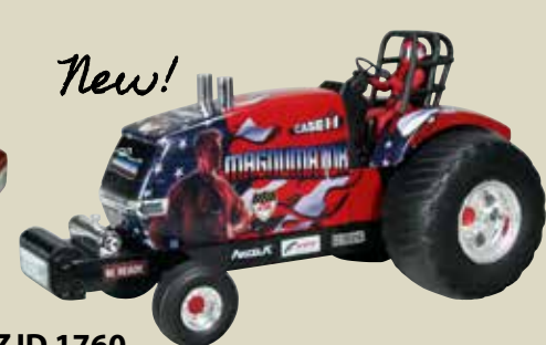
ZJD 1760 1:16 Case IH Magnumator 3 Puller