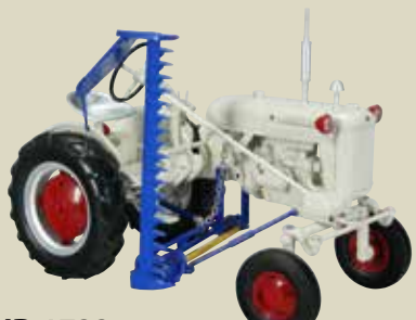
ZJD 1733 Farmall Cub (white) with Sickle Mower

Farmall 544 Gas Narrow Front with Gear Transmission & Wheel Weights