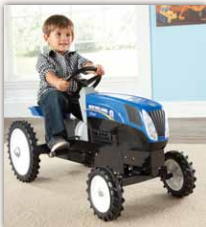
ERT13848 T7.260 Tractor Pack: 1 Die-cast and stamped steel. Bonus decals!