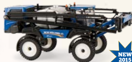
ERT13871 1:64 SP.400F Sprayer Pack: 12 Available to order on February OWP Est. ship May 2015 1600 gallon tank, 120' fold-out boom, boom raises and lowers, detailed interior.