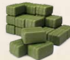
ZFN12665 24 Pack of Small Square Bales Pack: 12