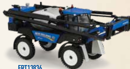
ERT13836 1:64 SP.365F Sprayer Pack: 12 While supplies last. Features 1600 gallon tank, 120' folding boom, boom arm will raise and lower, rear ladder, detailed interior.