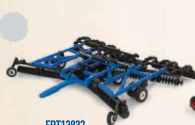
ERT13832 1:64 Tandem Disk Pack: 12 Free rolling wheels, wing frame folds up to transport position.