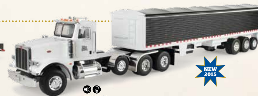
ZFN46406 1:16 Peterbilt 367 Truck with Grain Trailer Pack: 4 Available to order on February OWP Est. ship June 2015 Prototype shown. 45"L x 6.5"W x 7.5"H. Semi features lights and sounds, opening cab doors, steerable front wheels, adjustable cheater wheels and mirrors. Trailer features opening tarp, opening grain hopper doors, movable jack stand, adjustable cheater wheels. Requires (3) "AAA" batteries (included).