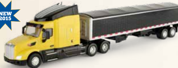
ZFN46391 1:32 Peterbilt Model 579 with Grain Trailer Pack: 4 Available to order on February OWP Est. ship June 2015 Authentic detail on cab. Trailer features opening tarp and working hoppers.