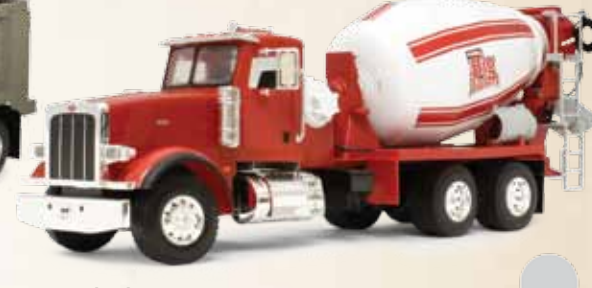
ZFN46210 1:16 Peterbilt Model 367 Truck with Cement Mixer Pack: 4 Lights and sounds, opening cab doors, steerable front wheels, mixer body spins, movable unloading shoot. Requires (3) "AAA" batteries (included).