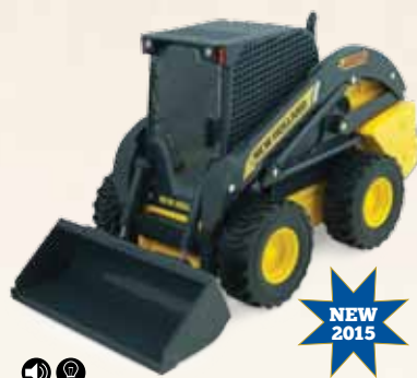
ZFN46455 1:16 L225 Skid Steer Loader Pack: 4 Available to order on February OWP Est. ship June 2015 Prototype shown. Lights and sounds, boom arms raise and lower, bucket and fork lift dump and are removable. Requires (3) "AAA" batteries (included).