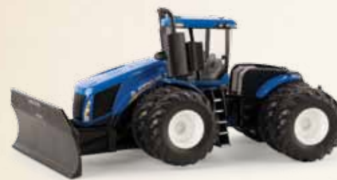
ERT13869 1:64 T9.645 with Grouser® Blade Pack: 12 Front and rear duals, rear weights, articulating body, cab and rear fender lights, cab glass, detailed interior, new right and left front fenders, new exhaust system.