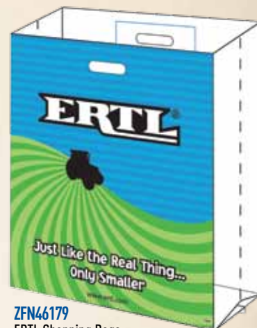
ZFN46179 Ertl Shopping Bags Pack: 125 Dimensions: 24" x 22" x 6"