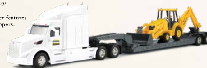
ERT46355 1:32 Peterbilt Model 579 Semi with LowBoy Trailer and Backhoe Loader Pack: 4 Lowboy features folding front ramps and trailer hitch frame is detachable from body. Backhoe features working loader and both backhoe and front loader are detachable.