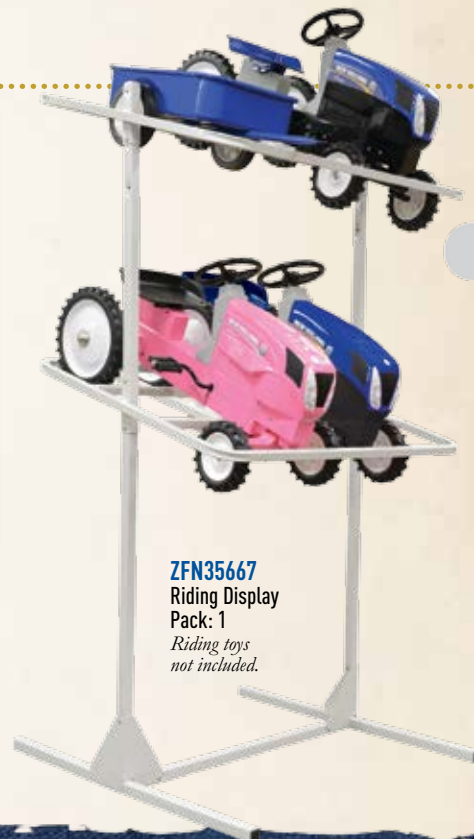
ZFN35667 Riding Display Pack: 1 Riding toys not included.