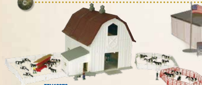
ZFN12279 1:64 Dairy Barn Set Pack: 4