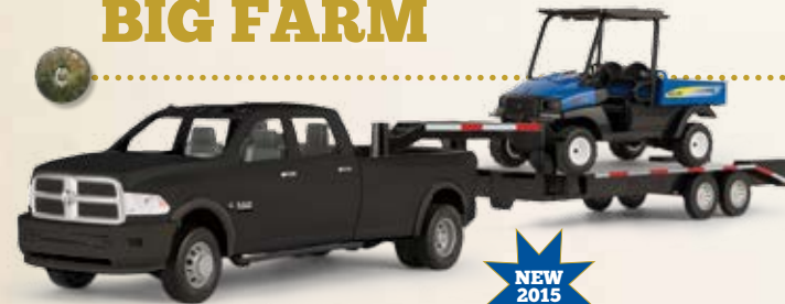
ERT46457 1:16 Ram with Gooseneck Trailer and Rustler™ 125 Pack: 4 Available to order on February OWP Est. ship June 2015 Prototype shown. Truck features lights and sounds, opening tailgate and an open cab roof for easy access to the steering wheel and rear hitch. Requires (3) "AAA" batteries (included). Gooseneck trailer features folding rear ramps and adjustable jack stands. Rustler™ 125 features lights and sounds, lifting dump box and opening tailgate. Requires (3) "AAA" batteries (included).