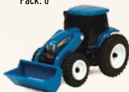
ERT35630DS 3" Tractor with Loader Pack: 8