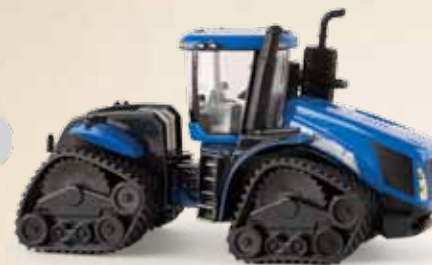
ERT13856 1:64 T9.700 with SmartTrax™ Pack: 12 Articulated, front steps, cab and rear fender lights, cab glass, detailed interior, new track and track frames, new right and left front fenders, new exhaust system.