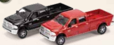
ZFN46246 1:64 Dodge Ram Assortment Pack: 8