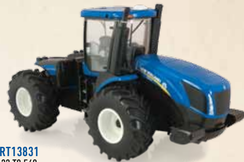
ERT13831 1:32 T9.560 Pack: 3 Articulating and oscillating body, rear fender lights, fuel tank style rear fenders.