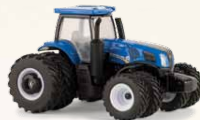
ERT13865 1:64 T8.435 Pack: 12 Front and rear duals, oscillating front axle, front fenders, detailed interior.