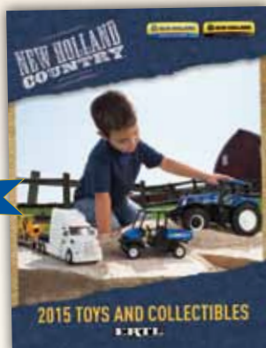
ERT17656 2015 Catalog Pack: 5