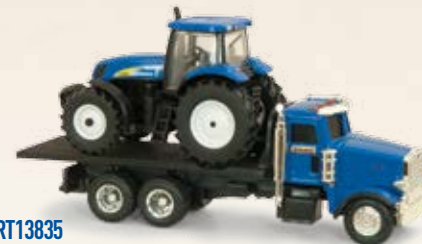
ERT13835 1:64 Peterbilt Model 367 Truck with T7030 Pack: 12 Chrome wheels, air cleaner, visor, exhaust stack, grille and front bumper with New Holland and Peterbilt logos tampos printed on the cab. Tractor fits on Peterbilt straight truck flat bed and has oscillating wide front axle and detailed interior.