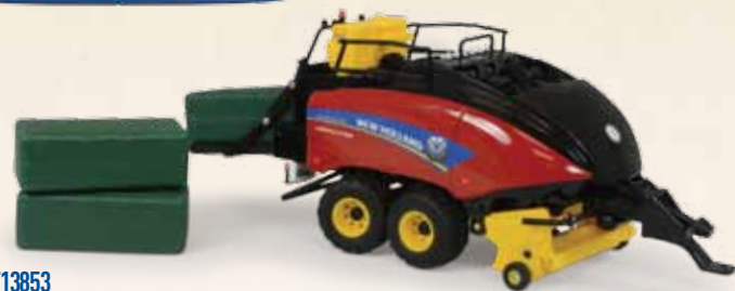
ERT13853 1:32 BigBaler 340 Pack: 3 Includes 3 square bales, rotating pick-up teeth and feeding augers, opening rear chamber.