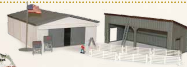
ZFN12930 1:64 Machine Shed with Lean To Pack: 4