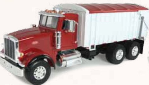
ZFN46184 1:16 Peterbilt Model 367 Truck with Grain Box Pack: 4 Lights and sounds, opening cab door, steerable front wheels. Tilting grain box, opening rear door, removable cover. Requires (3) "AAA" batteries (included).