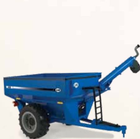
ERT46214 1:16 J & M 875 Grain Cart Pack: 4 Working unloading auger, opening grain door, rotating grain spout, adjustable hitch fits most 1:16 scale.