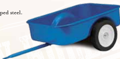
ERT13818 Blue Pedal Tractor Wagon Pack: 1