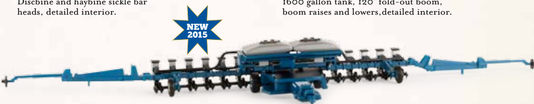
ERT13884 1:64 SP580 Planter Pack: 12 Available to order on February OWP Est. ship May 2015 Die-cast frame and tongue, row units raise and lower and pivot for transportation, telescoping tongue for transport, marker arms raise and lower.