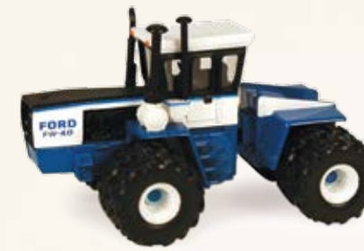
ERT13863 1:64 Ford FW-40 Pack: 12 Front and rear duals, articulated, oscillating front axle, toy hitch.