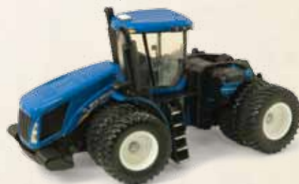
ERT13845 1:64 T9.615 Pack: 12 Articulated, front and rear duals.