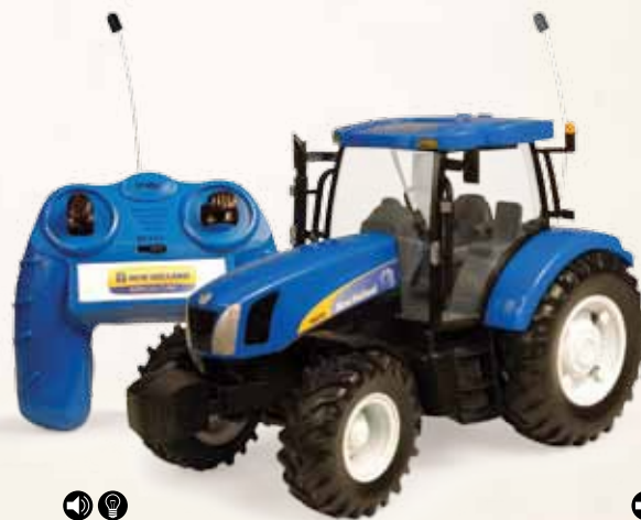
ERT35906 1:16 Radio Control Tractor Pack: 2 Lights and sounds, steers left and right, forward and reverse, 27 MHZ frequency, adjustable hitch, fits most 1:16 scale. Requires (4) AA batteries and (1) 9V battery, (not included).