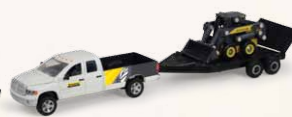
ERT13862 1:64 Dodge Pickup with Trailer and L170 Skid Steer Loader Pack: 12 Pickup has New Holland Construction graphics, bumper hitch style trailer with ramp, skid steer has working arms and bucket.