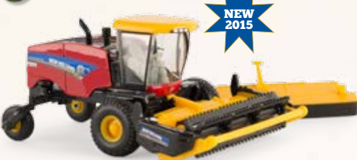
ERT13867 1:64 Speedrower® 220 Pack: 6 Available to order on February OWP Est. ship February 2015 Discbine and haybine sickle bar heads, detailed interior.