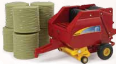
ERT13811 1:64 BR7090 Round Baler with 6 Bales Pack: 12 Opening bale chamber tailgate to unload bales.