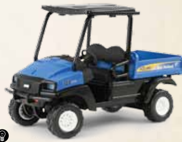
ERT46293 1:16 Rustler 125 Pack: 4 Lights and sounds, cargo/box raises and lowers, tailgate opens, steerable front wheels. Requires 3 "AAA" batteries (included).