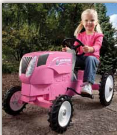
ERT13850 Pink T7.260 Tractor Pack: 1 Die-cast and stamped steel. Bonus decals!