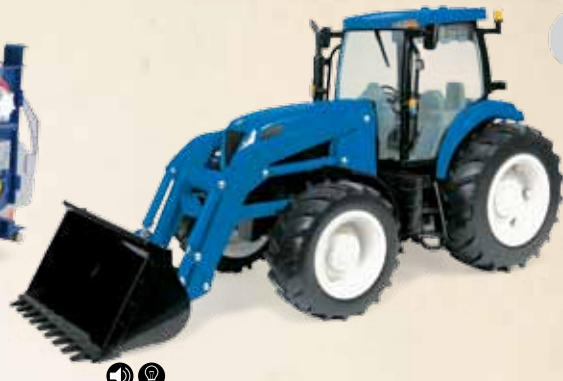
ERT35635DS 1:16 T7050 with Front End Loader Pack: 4 Removable loader raises and lowers, bucket pivots, removable cab is open in back for access, lights and sound, adjustable hitch fits most 1:16 scale. Requires (3) "AAA" batteries (included).