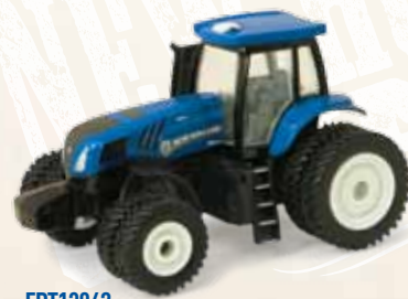
ERT13842 1:64 T8.420 Pack: 12 Front and rear duals, Auto Command.