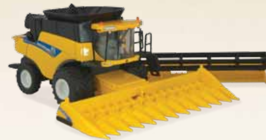
ERT13829 1:64 CR8090 Combine Pack: 6 12 row corn head and 30 foot grain head, rotating unloading auger.