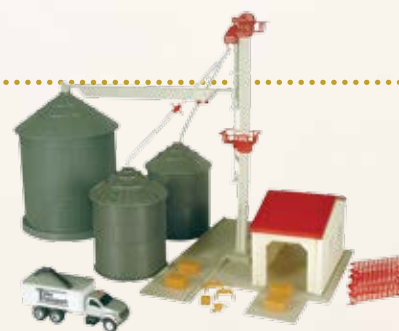
ZFN12924 1:64 Grain Elevator Set Pack: 4