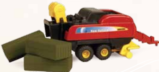
ERT13787 1:64 BB9080 Big Square Baler Pack: 12 Tandem axle, pick-up head, chute raises and lowers.