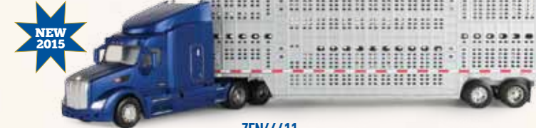
ZFN46411 1:32 Peterbilt Model 579 with Livestock Trailer Pack: 4 Available to order on February OWP Est. ship June 2015 Authentic detail on cab. Cattle trailer features working rear door and ramp.