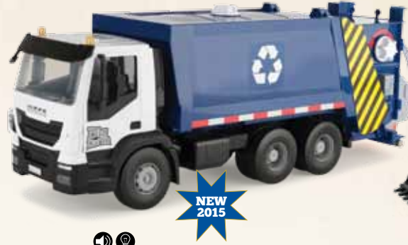
ZFN43057 IVECO Recycling Truck Pack: 4 Available to order on February OWP Est. ship March 2015 Prototype shown. Lights and sounds, features lifting rear gate to load and unload recycling. Includes a small recycling bin. Requires (3) "AAA" batteries (included).