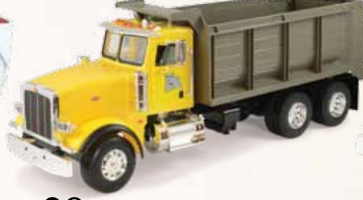
ZFN46210 1:16 Peterbilt Model 367 Truck with Dump Box Pack: 4 Lights and sounds, opening cab doors to access the steering wheel, steerable front wheels. Tilting dump box and opening rear door, rear hitch. Requires (3) "AAA" batteries (included).