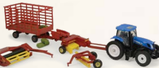
ERT13861 1:64 T7.270 with Haying Set Pack: 12 Set includes: pull type mower, haybine, hay rake, square baler, bale throw wagon and 4 square bales.