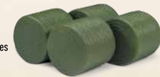
ZFN13189 1:16 4 Pack of Round Bales Pack: 4