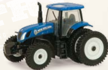
ERT13844 1:64 T7.235 with Duals Pack: 12 Oscillating front axle, updated exhaust system and fuel tanks, rear duals.