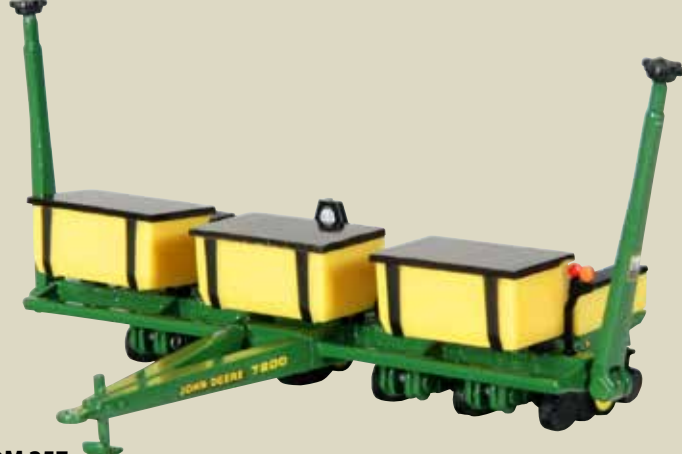
JDM 257 John Deere 7200 MaxEmerge 6-Row Planter with Dry Fertilizer Tanks