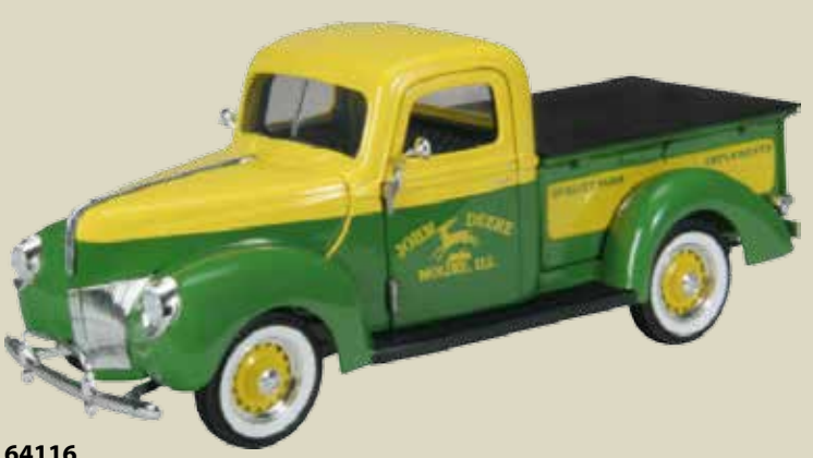
64116 John Deere 1940 Ford Pickup