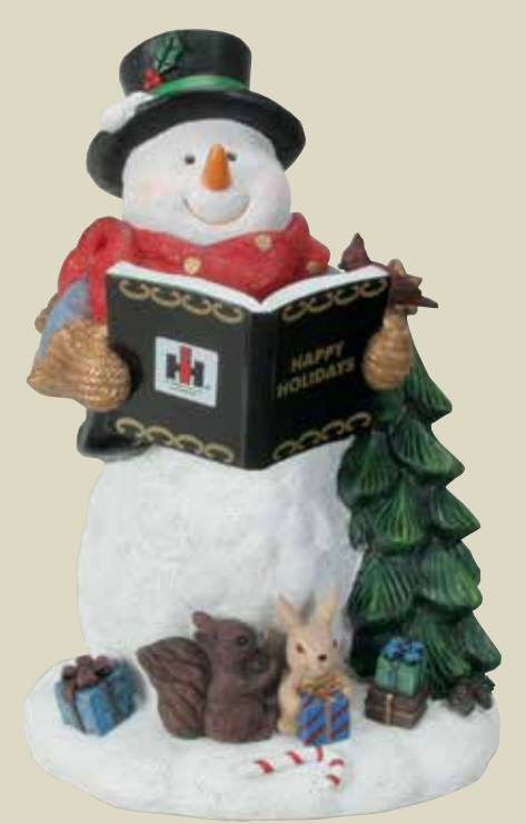
ZJD 1737 Case IH 2013 9" Snowman - 8th in a Series