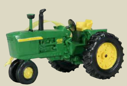
JDM 651 John Deere 4020 Tractor Ornament