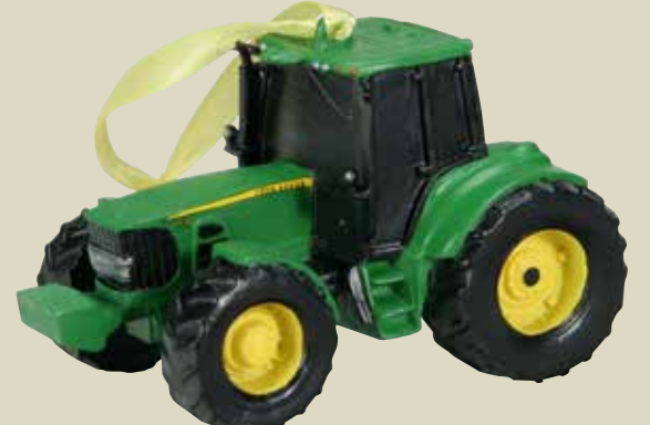
JDM 650 John Deere 7530 Tractor Ornament