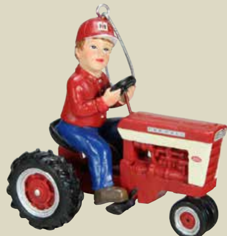
ZJD 1747 Case IH Boy on Riding Tractor Ornament